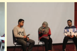
Figure 3: Patient sharing session