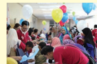
Figure 1: The participants enjoyed making key chain

A total of 250 patients with psoriasis and their care taker came together to create awareness that the ailment is not contagious. Other activities include Zumba dance, DIY key chains, balloon art, face painting, doodling competition, psoriasis & skin health exhibition, skin & dental health screening, patient sharing session, public health talks, quiz, lucky draw and photo booths.