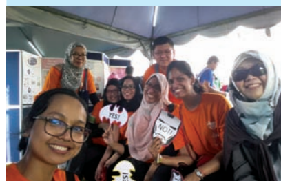
Figure 1. Selayang volunteers

The main objective of Acne Awareness Campaign is to increase public awareness especially teenagers about acne through array of fun activities and educational talks. Educational talks were held in the morning till afternoon where medical officers from Selayang Hospital (Figure 1) and Primary Care Medicine, Faculty of Medicine UiTM talk about causes and treatment of acne, lifestyle measures with a Q & A session at the end. It received an overwhelming response as the talk was engaging and interactive which managed to attract more than 80 participants.