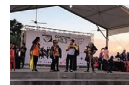
MCs in action