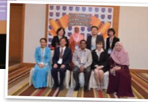
Figure 2: Minister & Exco members

acne scars" and "Non-invasive Body contouring: How I do it".