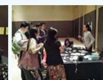
5. Leaflets and video aided patient education