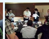
3. Dilution of patient's own product