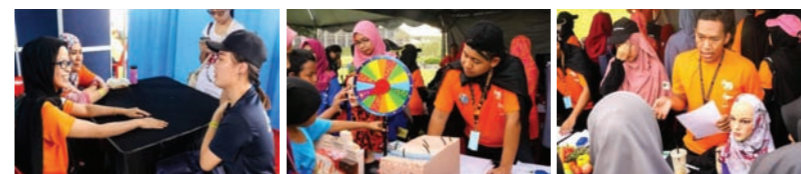
Volunteers busy at education booth