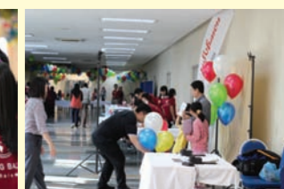
Figure 6: Photo booth