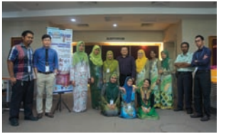
Figure 1: My Dream Team

We also hope that through courses like these that we will be able to get more young doctors to develop an interest in Dermatology and to pursue it as their subspecialty. I would like to thank all our invited speakers, co-organizers, committee members, sponsors and anyone who in one way or the other has contributed in making this event possible.