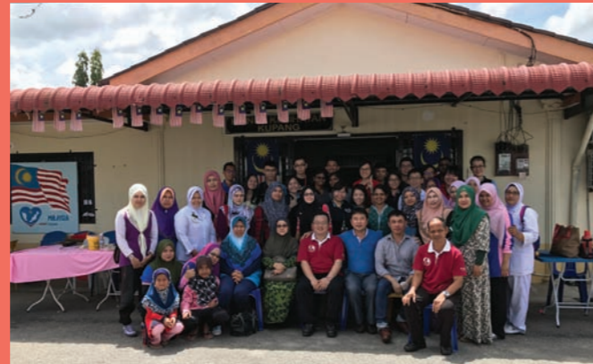
Group photo of all volunteers

Friends@Charity group also helped to set up screening clinics for eye diseases, hearing problem and paediatric clinic. Bravo to all, for making the event a great success!