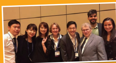
A fun moment with distinguished dermatologists and new friends from various countries in the 2017 international scholarship recipient dinner of AAD

Finally, I would like to thanks AAD for giving me the international scholarship to attend this great conference. Of course, all this happened with the encouragement from Dermatological Society of Malaysia for me to interact and share our knowledge with our dearest worldwide friends.