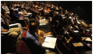
Figure 2: Overwhelming response from the participants