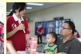
Figure 2: Dental health corner