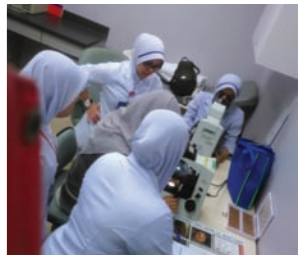
Figure 2: Hansen's course: SSS reading