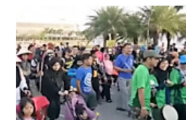
Toddlers also joining the charity walk