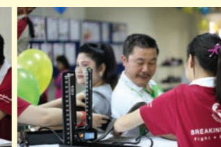
Figure 5: Medical check-up