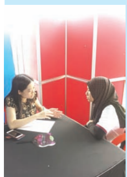
Figure 2. Acne Counselling