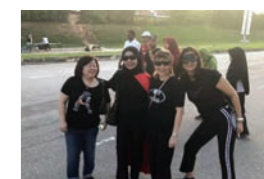
PDM power group & family

With the help of good media coverages, we sincerely hope that this event had reached the public with positive messages. We really appreciated the helps that we had from many kind individuals which had helped us to make this event a reality. Lastly, we should tap our shoulders for the good team works and efforts.