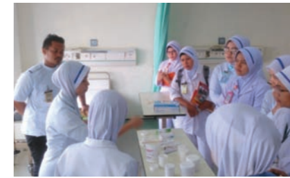
Figure 1: Clinical session on how to apply topical medication

Due to very limited scholarships for subspecialty training abroad, initiatives are now being carried out to train dermatologists in specific areas such as lasers, contact dermatitis, allergy in skin and dermatopathology in the local setting. Short courses abroad hopefully will make a comeback in better times.