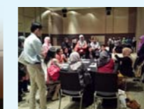
1. Patch test to commercial allergen series