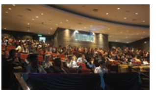
Figure 3: Total of 269 participants for NDS 2017