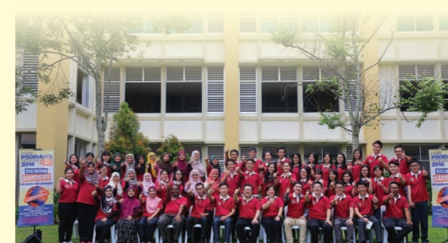
Figure 7: Group Photo of organizing committee and volunteers